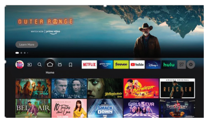
Amazon Fire Interface.

Abusing dominance to harm competitors and benefit related businesses: For several months after the launch of HBO Max in 2020, customers were unable to gain access to the service through Amazon devices. The dispute