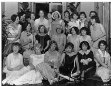
Frances Marion (seated on sofa with dog), the most prolific writer in Hollywood history, hosts a party for stars and writers, 1920s.

From 1921 to 1933, the Screen Writers Guild operated more as a club than a guild.