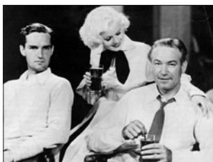
Screenwriter John Lee Mahin (left) working with star Jean Harlow and director Victor Fleming on the set of Red Dust , 1933.

Writers got organized in 1933, and they got serious. Within a few months, membership grew from just a handful to several hundred screenwriters. In 1937 the U.S. Supreme Court upheld the National Labor Relations Act, and the Screen Writers Guild called for an election. By 1939, they began collective bargaining with motion picture producers. The first contract, signed in 1941, brought protection for writers' onscreen credits.