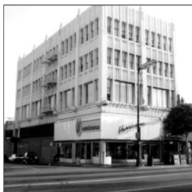
Hollywood Boulevard at Cherokee (1998). The location of the first Guild headquarters in 1933.

The salary cuts made them even more determined to organize other writers and make themselves into a force to which the studios would have to pay attention.