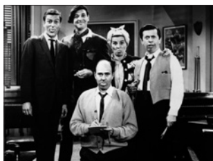
Creator-writer Carl Reiner (seated) and "writing staff" of The Dick Van Dyke Show , 1960s.

Most organizational efforts were postponed during World War II. At the same time the Screen Writers Guild went through a period of internal political struggle. By 1949, the disparate factions of the Guild—screenwriters, television writers, radio writers, and others—began to unite.