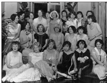
Frances Marion (seated on sofa with dog), the most prolific writer in Hollywood history, hosts a party for stars and writers, 1920s.

From 1921 to 1933, the Screen Writers Guild operated more as a club than a guild.