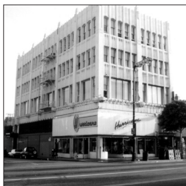
Hollywood Boulevard at Cherokee (1998). The location of the first Guild headquarters in 1933.

The salary cuts made them even more determined to organize other writers and make themselves into a force to which the studios would have to pay attention.