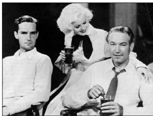
Screenwriter John Lee Mahin (left) working with star Jean Harlow and director Victor Fleming on the set of Red Dust, 1933.

Writers got organized in 1933, and they got serious. Within a few months, membership grew from just a handful to several hundred screenwriters. In 1937 the U.S. Supreme Court upheld the National Labor Relations Act, and the Screen Writers Guild called for an election. By 1939, they began collective bargaining with motion picture producers. The first contract, signed in 1941, brought protection for writers' onscreen credits.