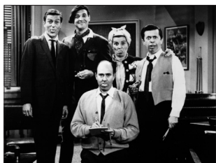
Creator-writer Carl Reiner (seated) and "writing staff" of The Dick Van Dyke Show, 1960s.

Most organizational efforts were postponed during World War II. At the same time the Screen Writers Guild went through a period of internal political struggle. By 1949, the disparate factions of the Guild—screenwriters, television writers, radio writers, and others—began to unite.